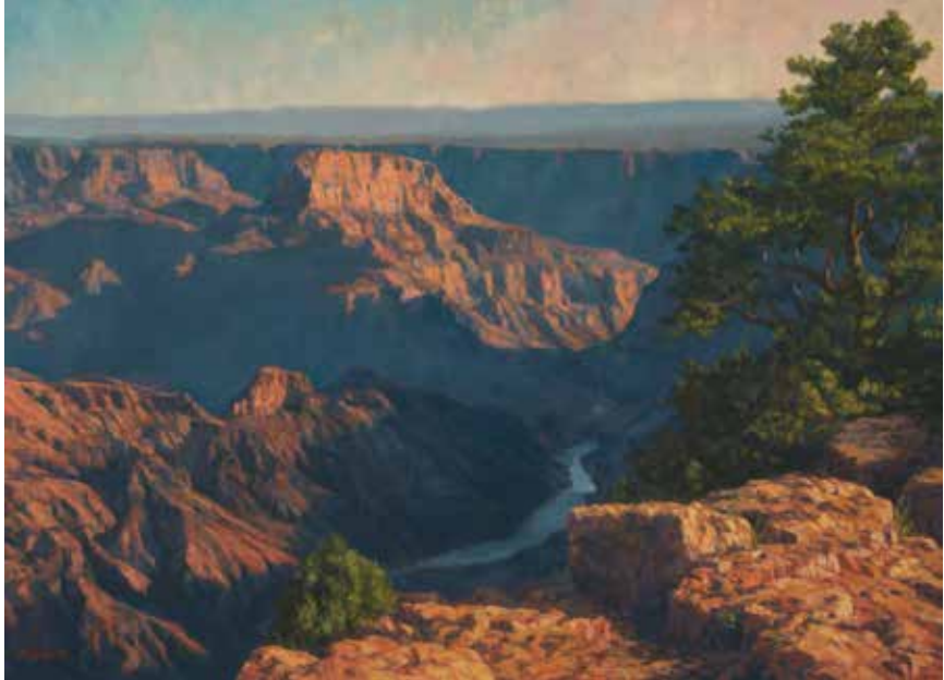
East Rim Morning Glory